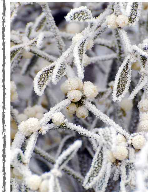
Five cold things