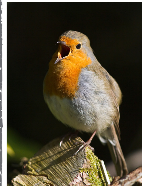
Four calling birds