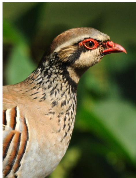
A red-legged partridge (pear tree optional)