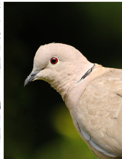
Two collared doves