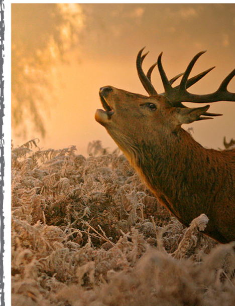
Nine red deer prancing